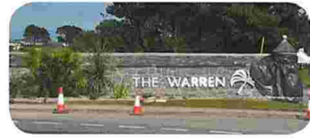
Above - The new entrance under construction. The upgrading scheme included new signage, block pavior footpaths and the creation of planting beds filled with Mediterranean sub-tropical species.

Lambe Planning and Design deal with both large and small commissions, successfully negotiating and gaining planning consents for proposals which in many cases are contrary to restrictive planning policies. They have a strong track record in gaining planning approvals for new, high quality Holiday Parks on green-field sites and in sensitive locations. They also specialise in the upgrading of existing parks and facilities, where their expertise in improving visual appearance through careful design of the layout and sympathetic landscaping, plays an important role in achieving a successful outcome.