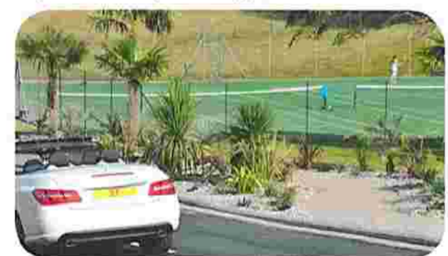
Above - The first phase of Mediterranean planting completed around the new meandering footpaths and tennis courts.

New Holiday Home and Holiday Lodge development - Advising the owners of a large country estate regarding diversification opportunities to create a new holiday development allied to sporting and recreational facilities - Northern England.