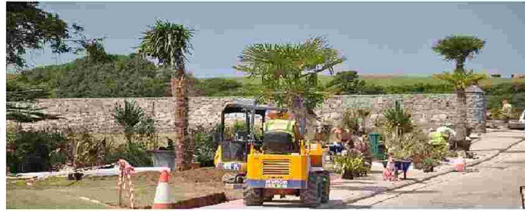
Above - The six metre tall Palms and sub-tropical Mediterranean planting being located.

To create a unique and prestigious development, planting was sourced from a Chelsea Flower Show multi-award winning nursery. The planting scheme included importing 6.0m tall Palms from Italy and 20 year old Mexican plant species from Spain. Subtle lighting was also introduced along the pathways and within the planting beds to create gentle silhouettes at dusk of the unusual architectural plants. Further phases of upgrading, following a similar theme, are currently being undertaken at The Warren by Lambe Planning and Design.