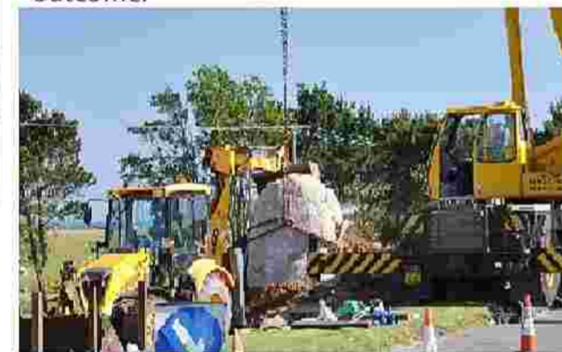
Above - The thirteen tonne boulder being craned into position at the Warren entrance to create a new feature sign.