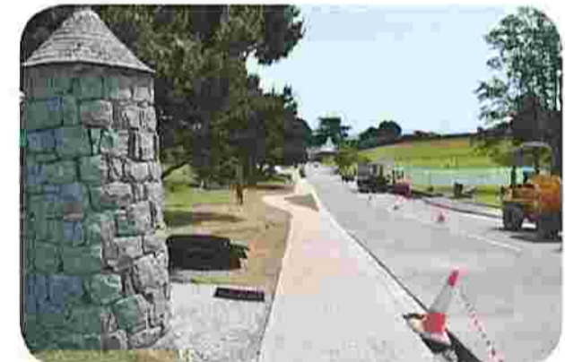
Above - The new meandering footpaths under construction, entrance walling and new planting beds.